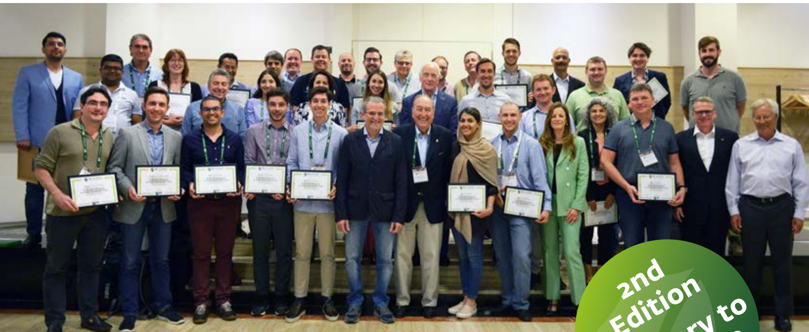
Alumni of the 1st Edition received the program completion certificate in Seville, May 2018.