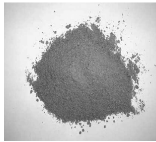
Photograph No 2