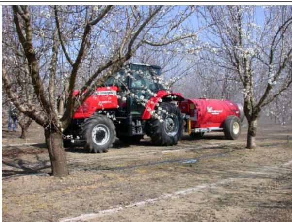
Target-sensing application equipment can often reduce pesticide use without sacrificing efficacy.

Products formulated as emulsifiable concentrates (ECs) have the highest VOC emissions of the various liquid formulations. This is primarily due to the solvents and other inert ingredients in these products. Solid formulations, such as granules or wettable powders, have much lower VOC emission rates. Table 1 shows the reduction in VOC emissions that can be